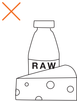
RAW MILK CHEESES