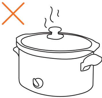
COOKED FOOD From your home or unregistered sources